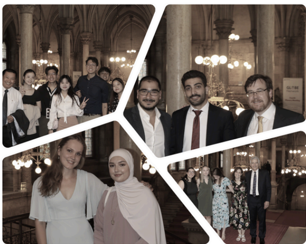
Impressions, Final's Banquet IBA-VIAC CDRC 2023

Since then, we have established a global platform that connects current and future mediation and negotiation experts. Our Moot mimics near-real mediation and negotiation experiences. We team up with top universities and institutions from all across the world and offer one of the best learning and networking experiences for ADR enthusiasts worldwide. The IBA-VIAC CDRC now sets the trend for a totally fresh generation in the handling of disagreements, a whole new era of dispute resolution where parties take control over resolving their disputes as we continue to: