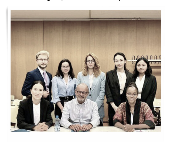
Competitors and Experts, IBA-VIAC CDRC 2023

World-leading dispute resolution experts assess the Mediator and Negotiator Teams. Our Expert