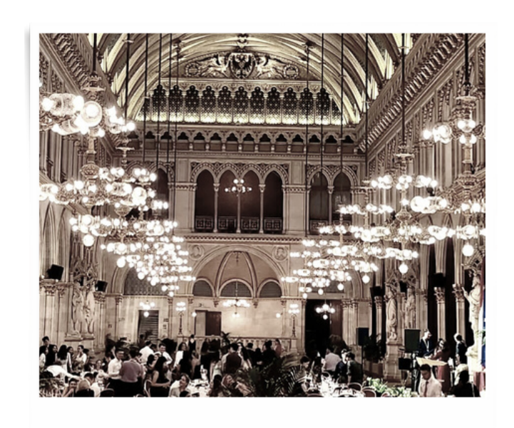
The splendor of the Festsaal, Rathaus of Vienna, Final's Banquet IBA-VIAC CDRC 2023