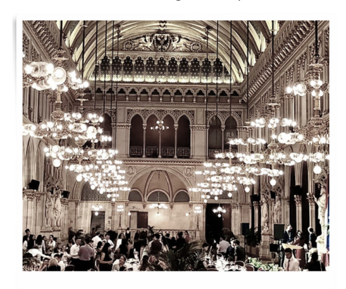
The splendor of the Festsaal, Rathaus of Vienna, Final's Banquet IBA-VIAC CDRC 2023

Since then, we have established a global platform that connects current and future experts. Our Moot mimics near-real mediation and negotiation experiences. We team up with top universities and institutions from all across the world and offer one of the best learning and networking experiences for ADR enthusiasts worldwide. The IBA-VIAC CDRC now sets the trend for a totally fresh generation of handling disagreements, a whole new era of dispute resolution where parties take control over resolving their disputes as we continue to: