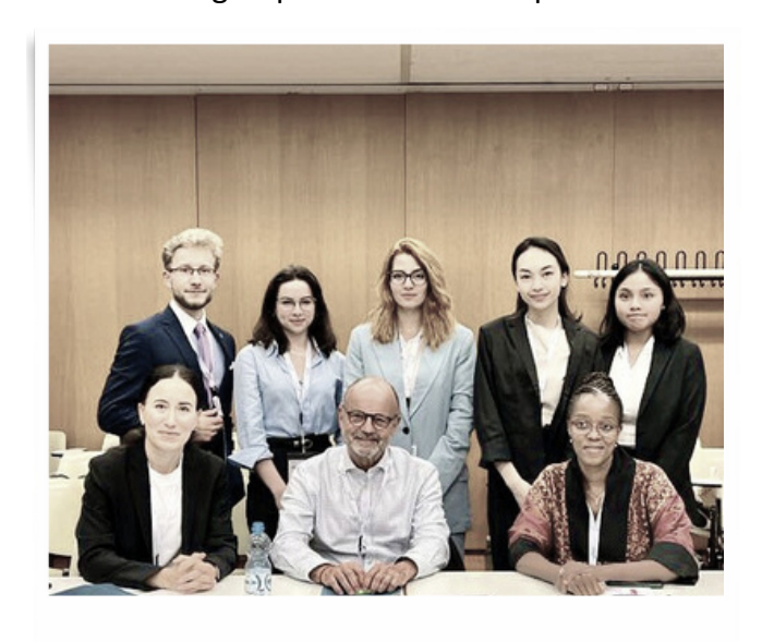
A panel at the CDRC 2023

World-leading dispute resolution experts assess the Mediator and Negotiator Teams. Our Expert